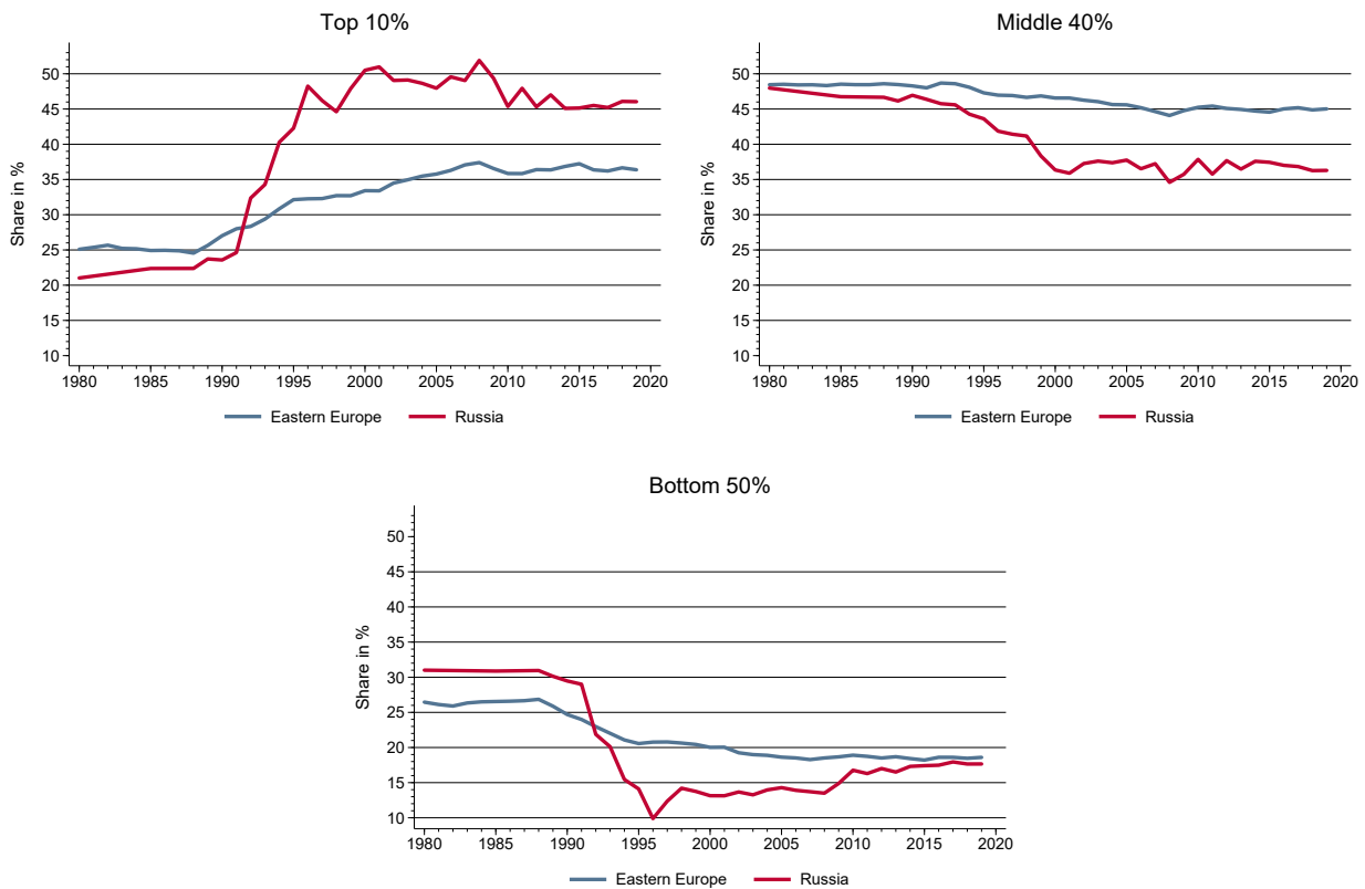
Figure 2. Income share of net national income for the top 10%, middle 40% (P50-90), and bottom 50% of income earners.

Note. Own elaboration based survey data, tax tabulations, and national accounts. For details see Neef (2020).