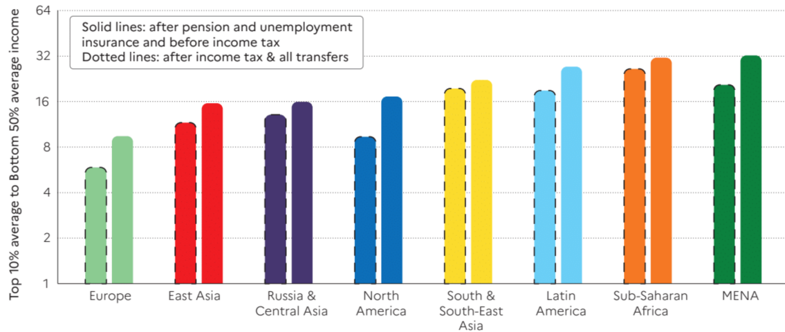
Figure 3: Redistribution (pre-tax vs. post-tax income distributions), by region

Notes: This graph, in Chancel et al. (2022) , shows the regional average levels of inequality in both pre-tax and now post-tax distributions. (Inequality is measured as the ratio of the average income of an individual within the top 10% of earners to the average income of an individual within the bottom 50% of earners.) For some interpretation: In North America, the bottom 50% earns 17 times less than the top 10% before income tax, whereas after income tax and all transfers, the bottom 50% earns 9 times less than the top 10%.